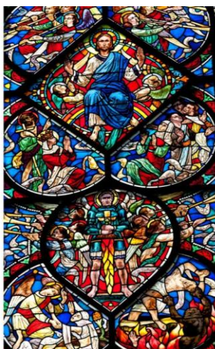
Figure 1. Gold nanoparticles are responsible for the red tint in stained glass windows and pieces of art.

A nanoparticle (NP) is defined as a particle with at least one dimension between 1 and 100 nm in size. Metallic NPs have become abundant in scientific research because they exhibit interesting and tuneable physical, optical, and chemical properties when compared with their bulk metal counterparts. This is true of gold NPs (AuNPs) in particular, which have optical properties that are easily manipulated and related to their physical state and chemical environment. 1 This means that they can be precisely engineered for a wide range of different applications. The use of AuNPs predates the scientific revolution, with the earliest known use being in the stained glass of the Lycurgus cup, thought to be preserved from the fourth century, A.D. 2 They have also been used frequently in stained glass windows, Figure 1. It is understood that gold particles dispersed in the glass are the cause of the deep red colour observable when light is shone through it.